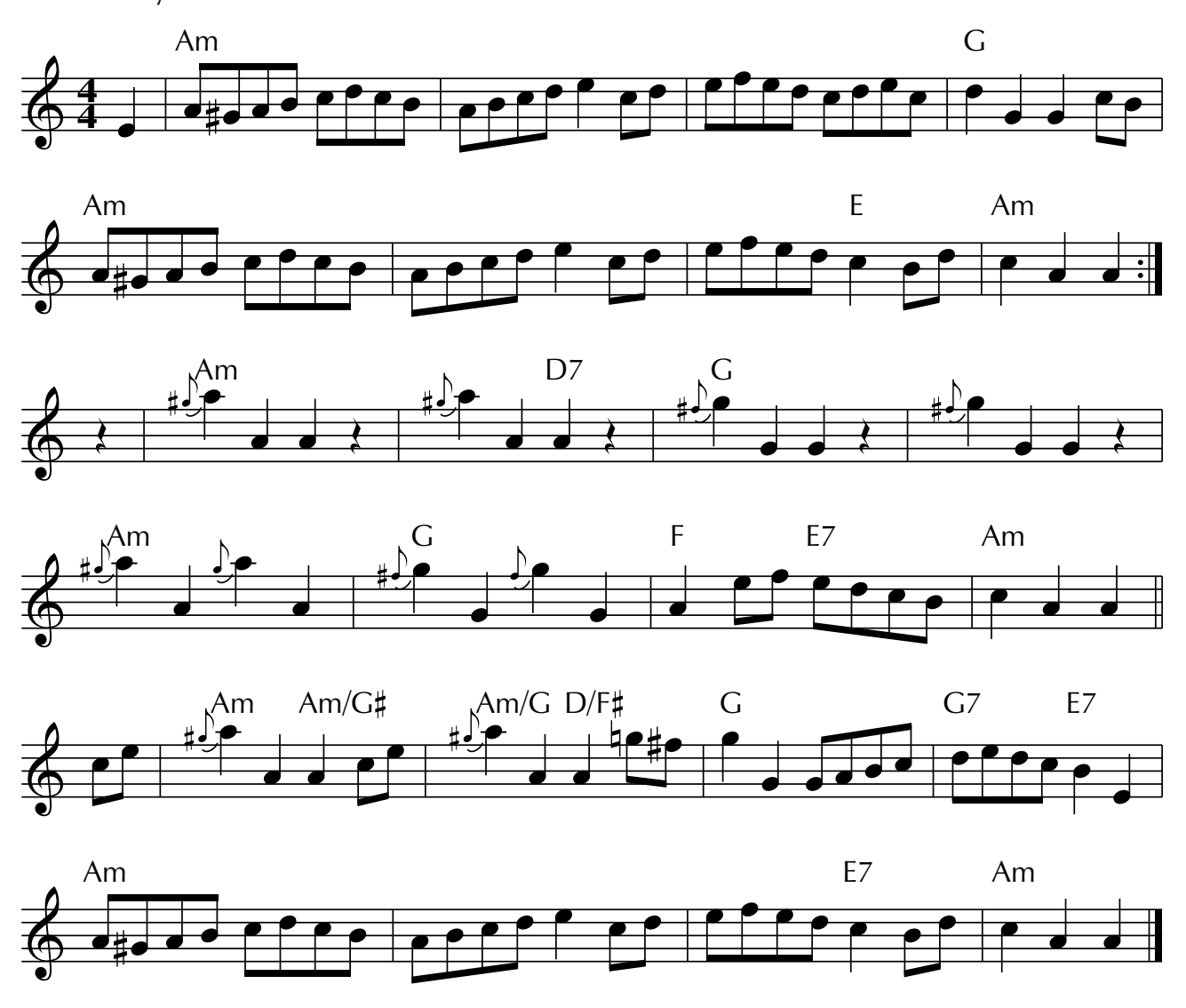
A suitable recording of this tune is available as the track, Catch the Wind , on the Music Makars CD of the same name (EWO 004).